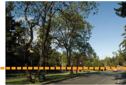
TREES ON PUBLIC LAND