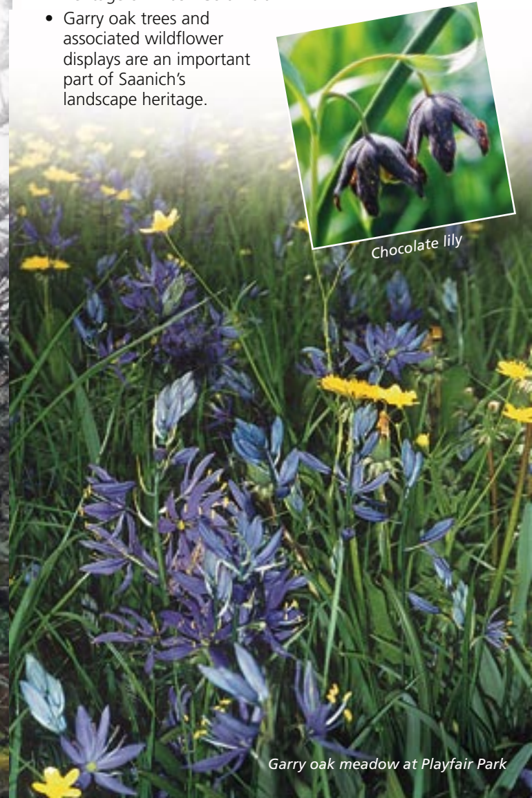
Garry oak meadow at Playfair Park