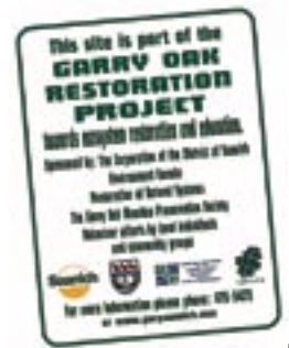
Follow the signs!