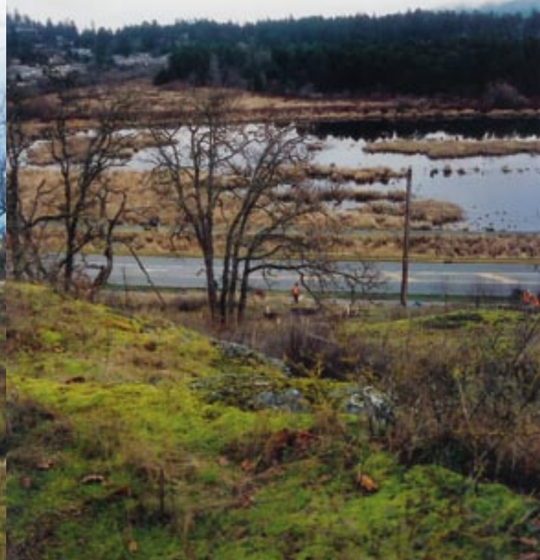
GORP site at Chatterton Hill Park