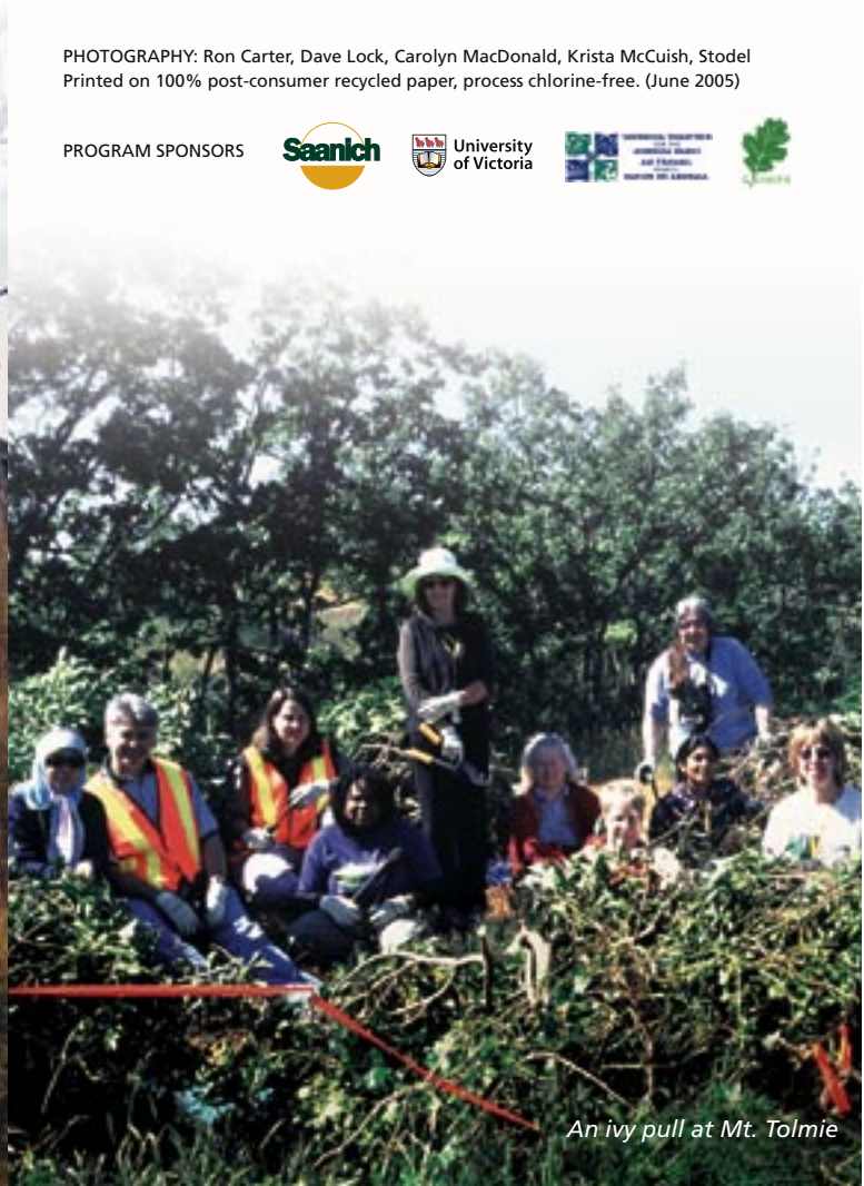
An ivy pull at Mt. Tolmie