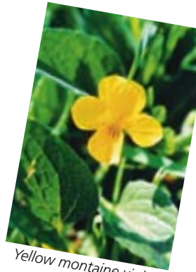
Yellow montaine violet