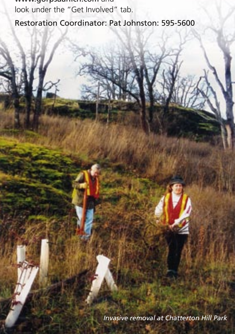
Invasive removal at Chatterton Hill Park