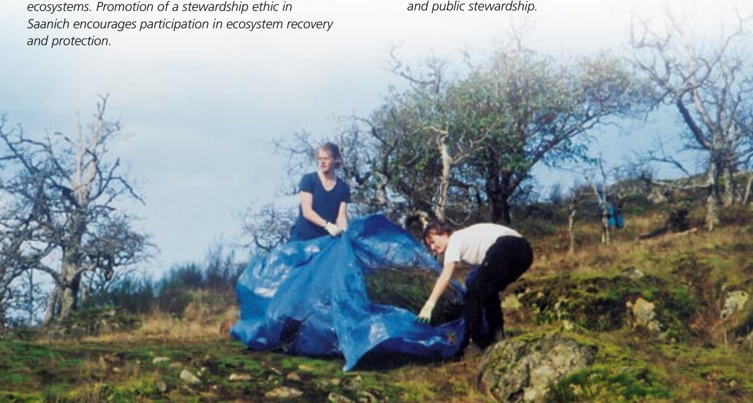
Scotch broom removal at Little Mt. Doug