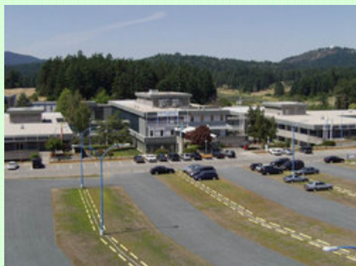
Vancouver Island Technology Park, Markham Street

A community with a vibrant, diverse and connected economy