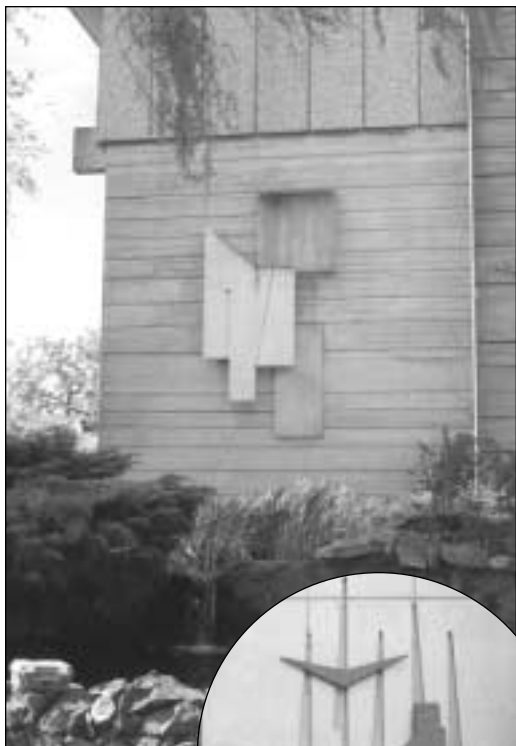
Sculptures, Saanich Municipal Hall