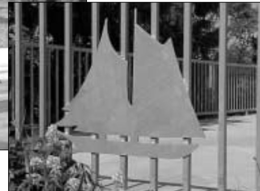
Handrail Detail, Top of Mount Tolmie

All arts donations, including public art donations, are subject to a jury process.