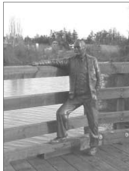
"Roy," Blenkinsop Bridge

Encourage, promote, and support the arts and artists, municipally and regionally for the benefit and opportunity of all Saanich residents.