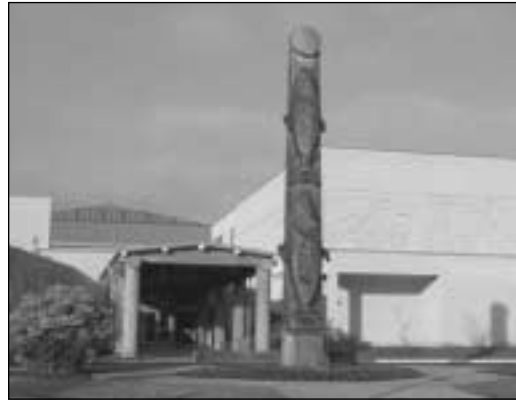
Totem and Fresco, Saanich Commonwealth Place

" Art is the signature of civilizations. "