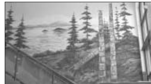
Mural in Saanich Road McDonald's